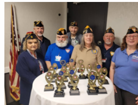
HL Region Americanism Essay Trophys to be presented to HLR winners.