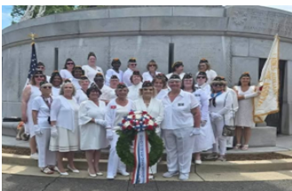
Group picture at the Mast of the Maine. Pilgrimage 2026