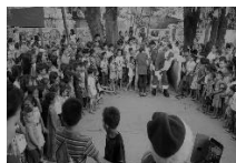
2017 Christmas for local children.