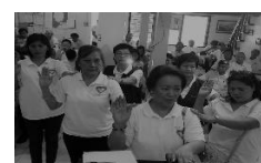
Preparing for Installation

Our LA FRA Auxiliary Members & Shipmates, from the Philippines, are doing many great projects in their communities and are an asset to the Auxiliary and Fleet Reserve Association.