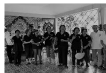
Singing Christmas songs for residents of MOP Apostolate