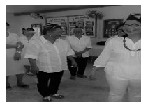
Installation of Officers