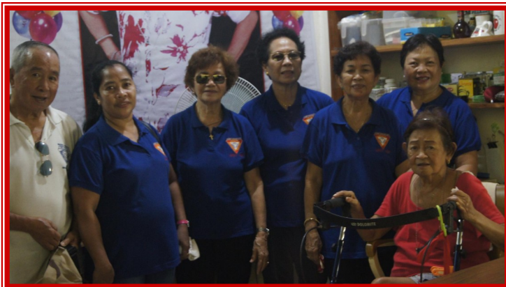
ABOVE: Members of Branch and Unit 127, Bicol Philippines on their annual Visitation, Outreach and Gift Giving mission.

To have your Unit's activities included in the Triangle, please send photos in either JPEG or PNG format, along with the name of the Unit and a description of the activity to: LWynnNES@yahoo.com They will be included as space allows.