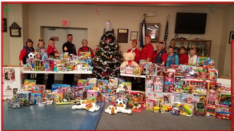
ABOVE: Branch and Unit 269 - Toys For Tots Presentation